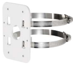
PFA152 Pole mount